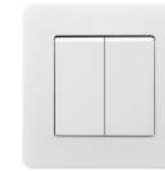
10A 250V 2 Gang 1 Way Switch 2 Gang 2 Way Switch