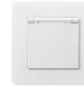
IP44 Waterproof France Socket