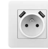
Double USB 2A Socket