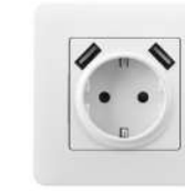
Double USB 2A Socket