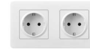
16A 250V Double Germany Socket