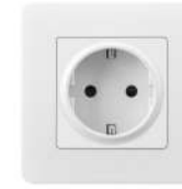
16A 250V Germany Socket