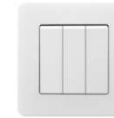
10A 250V 3 Gang 1 Way Switch 3 Gang 2 Way Switch