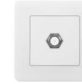
SAT TV Socket