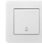
10A 250V Door Bell Switch