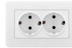
16A 250V Double Germany Socket