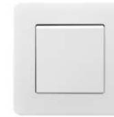
10A 250V 1 Gang 1 Way Switch 1 Gang 2 Way Switch