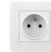
16A 250V French Socket