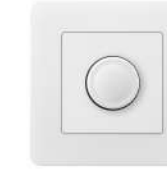
Light Dimmer Switch