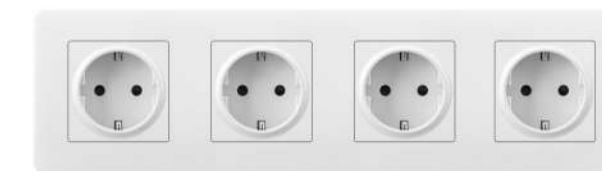
16A 250V Quadruple Germany Socket