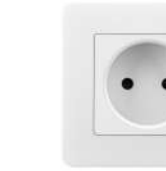
16A 250V Double Russian C1 Socket