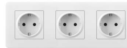
16A 250V Triple Germany Socket