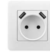
Double USB 2A Socket