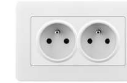
16A 250V Double French Socket