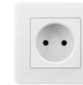
16A 250V Russian C1 Socket