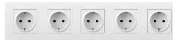
16A 250V Quintuple Germany Socket